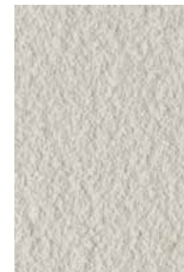
F4523 - light grey