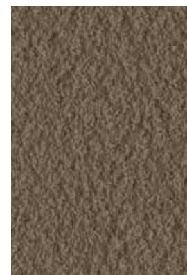
F8238 - dove grey