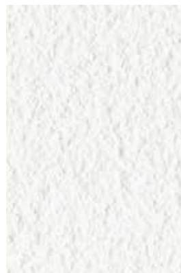
F4303 - white

Superando i limiti dei materiali tradizionali per gli ambienti umidi a contatto diretto con acqua, MOR-FO offre solo vantaggi evitando la presenza di fughe, ha un peso molto più contenuto di piastrelle o lastre in materiale ceramico, è molto facile da trasportare e tagliare in loco. MOR-FO è una Superficie strutturata opaca che permette una facile pulizia, resistente all'ammomiaca e a tutti i più comuni detergenti per la casa.