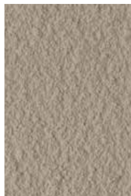
F6870 - grey