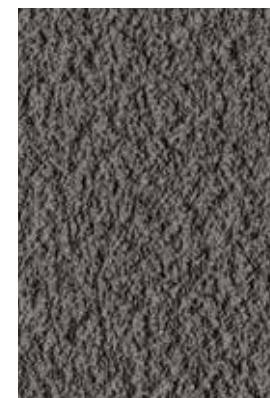
F4517 - anthracite