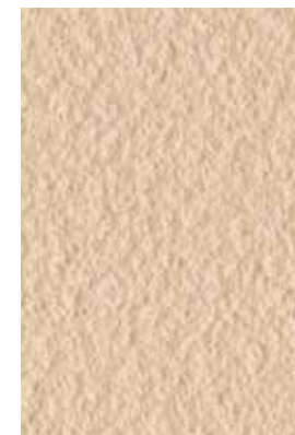
F4557 - cappuccino